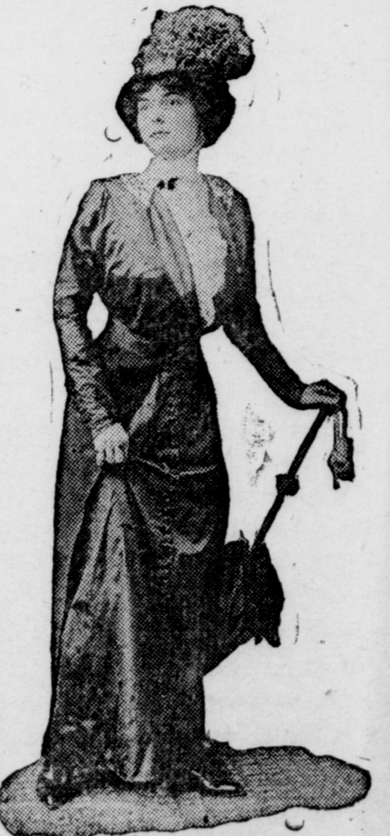
AN EXQUISITE BLACK CREATION. It is a slashed open skirt of black fabric—a mixture of wool and mohair. The two materials are combined in the bodice, which opens to show a little

La Belle Marquise Frock. This quaint costume might easily have stepped from the portrait of some French grande dame of high degree. The skirt of black taffeta buttons all the way down the front, and over it