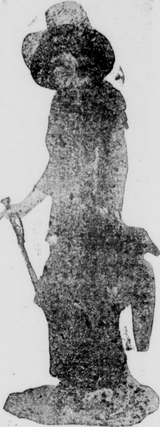
POINTED FOX SET.

"It is always interesting to know at the beginning of the season what the new styles are in furs as to shape and trimming, but of much more importance is the question, What are the fashionable furs? Last year among the inexpensive furs Australian opossum was high in favor. This year it has been set aside, and a new fur