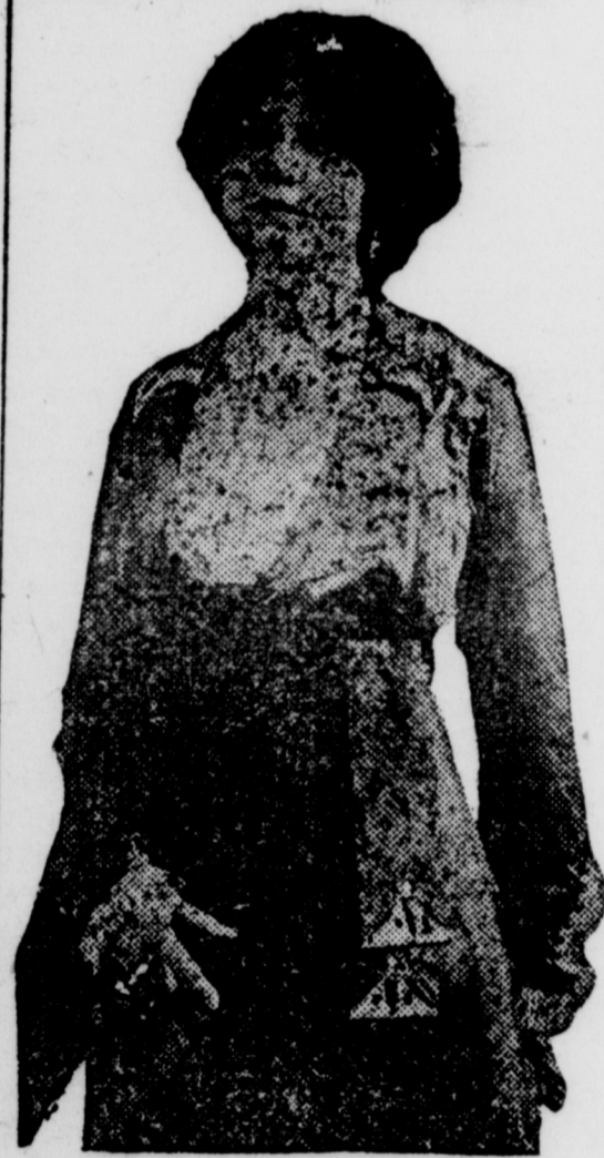
CHARMING ACCESSORY OF EMBROIDERED VELVET.

The stole sash falling at the front—back of the waist line and a little to one side is extremely fashionable.