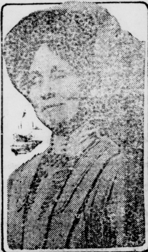
Mrs. EMMELINE PANKHURST

Mrs. Emmeline Pankhurst, who is shortly coming to Canada, is one of the original suffragets. She is easily the most prominent figure among the English suffragets, with her clever daughter Christabel perhaps a close second. Just now she is touring the United States, speaking for the cause of woman's suffrage.