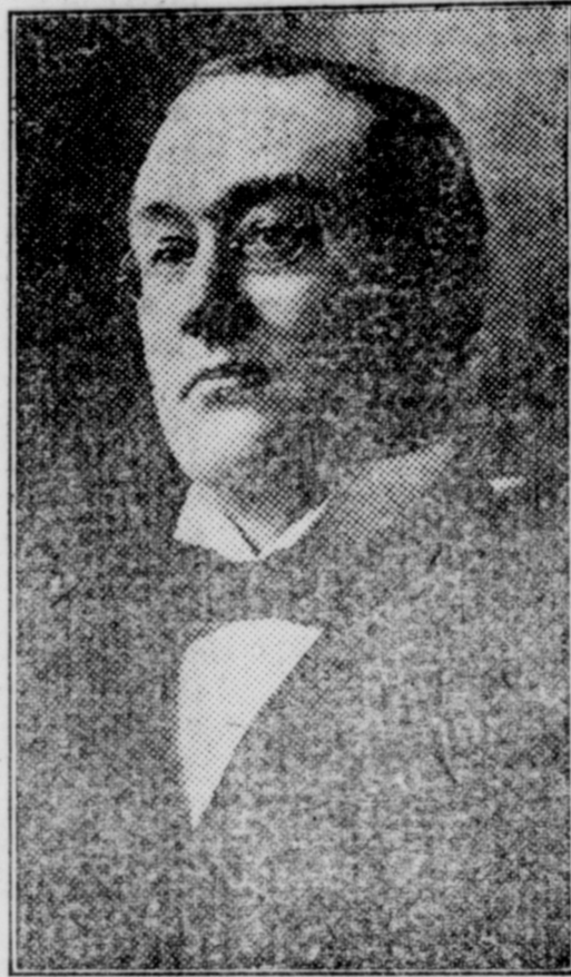
HON. G. H. MURRAY Premier of Nova Scotia.