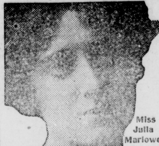
Miss Julia Marlowe

"I am glad to write my endorse- ment of the great remedy, Peruna . I do so most heartily."—Julia Marlowe.