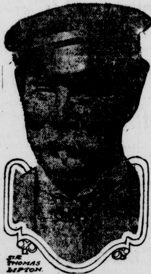
SIR THOMAS LIPTON