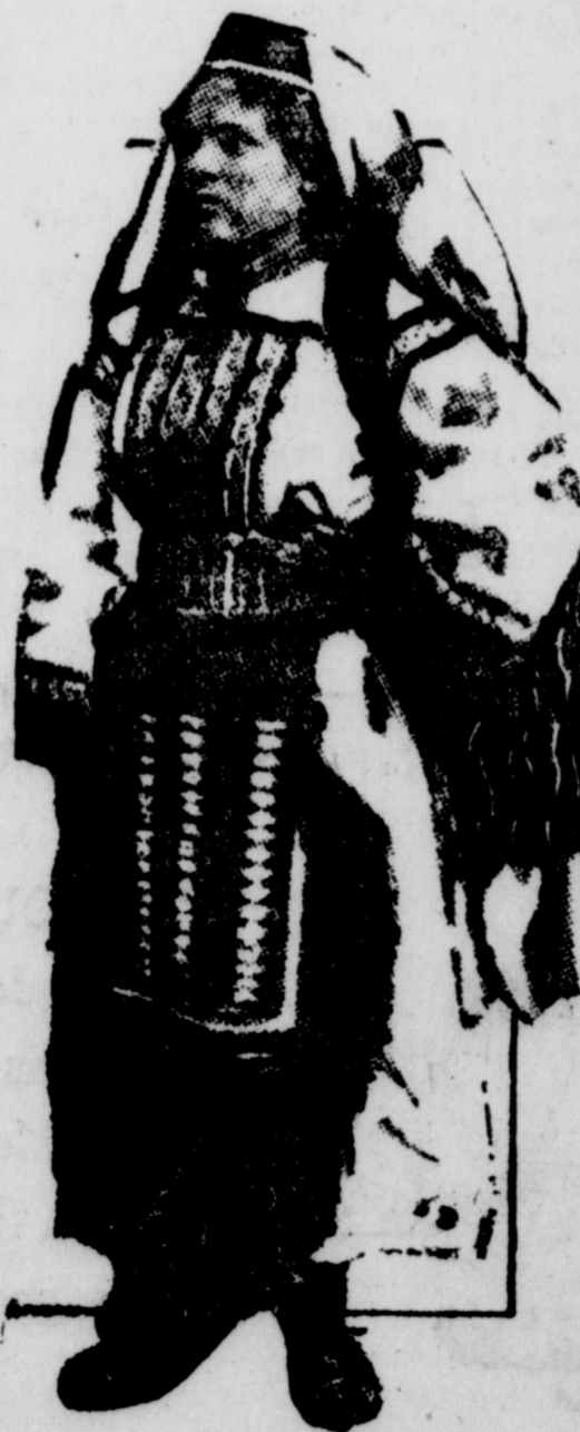
A Serbian Woman