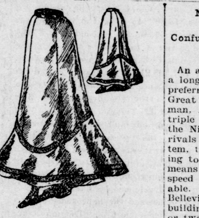
MISSES' FIVE-GORED SKIRT. 12 to 16 Years.

"A plate-layer must be stationed at each occupation crossing to prevent anything coming on to the line for at least thirty minutes before the royal train is due, and until it has passed.