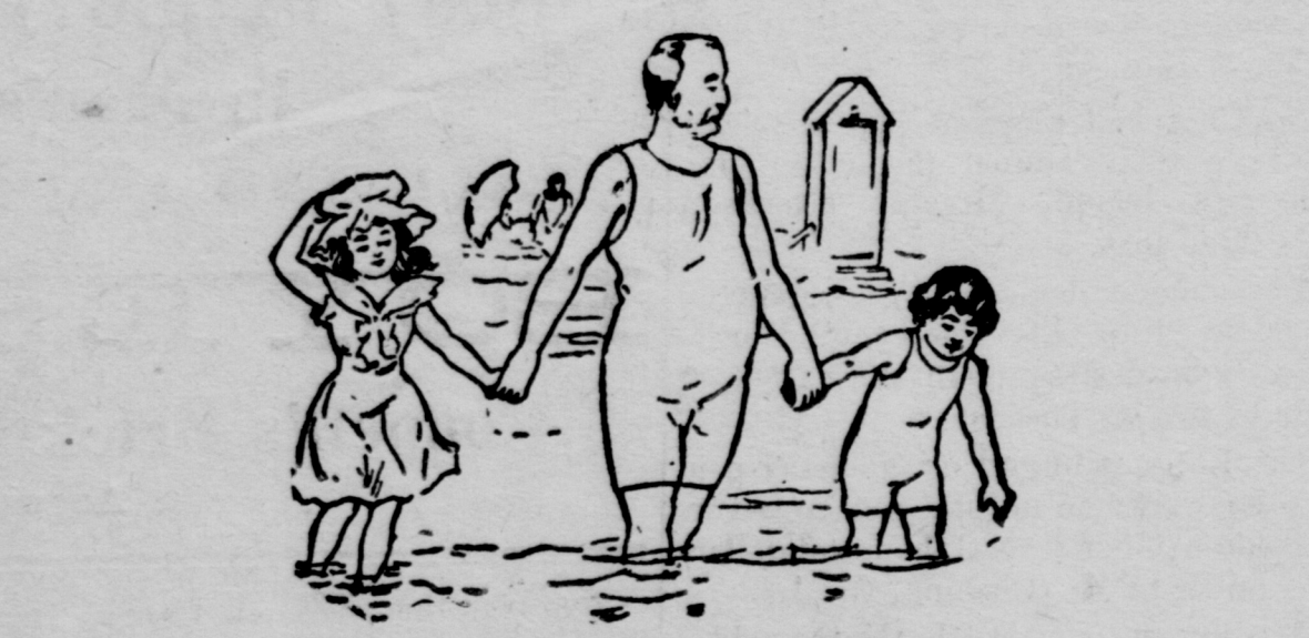
The Tall-Stout Man.

—Measures larger than normal on all lines below chest, smaller across back. His most effective coat is the close-fitting "Morning" or "Shooting" with cutaway front, having seams placed lower than usual, to give appearance of longer body. The waist in this type of "Fit-reform" suit is also apparently reduced, and the fullness subdued, by a uniform division of the upright seams. Quiet fabrics should be worn, as Worsted, Serges, or Homespuns, and large patterns should be studiously avoided. Makers brand and price in coat pocket. —$10.00, $12.00, $15.00, $18.00, $20.00, per suit. Catalogue free.