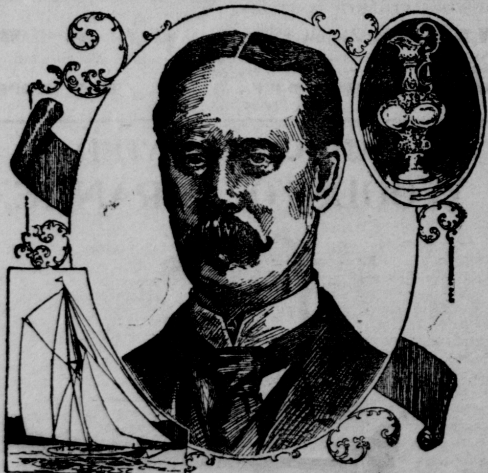
SIR THOMAS LIPTON, THE POPULAR ENGLISH SPORTSMAN.

Mother—What makes you cry that way? Johnnie—Our poor teacher has been ill so long, and—and— Mother—What! Did he die? Johnnie—No—no—he's getting well—boo—hoo.