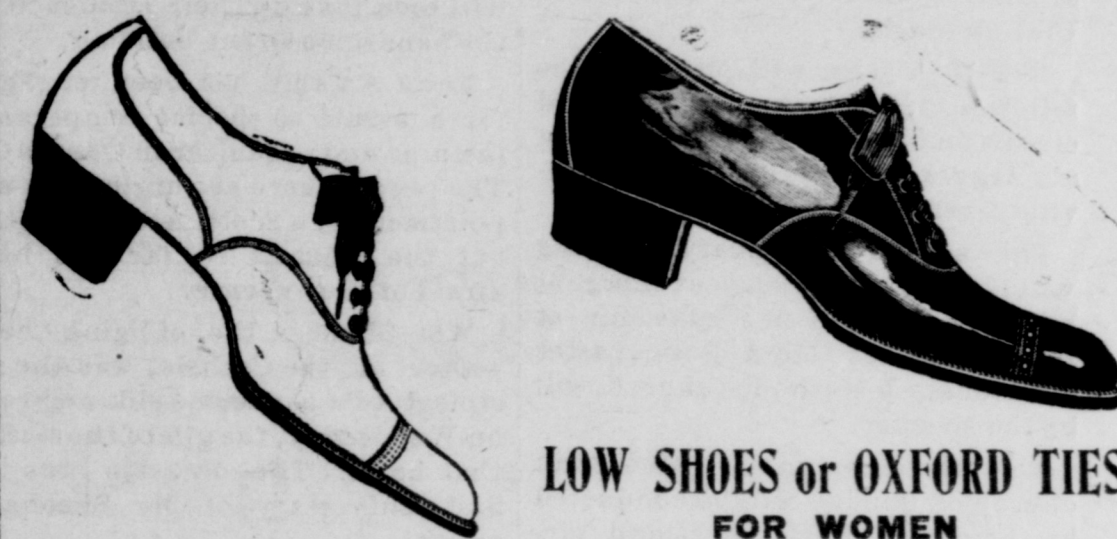
LOW SHOES or OXFORD TIES FOR WOMEN

Always was a strong point with us. We understand them better than many others. We know just where to go for the best of each kind. It is for this reason you get such good fitting ties here. The shape and color keeping qualities for which ours are so well known is accounted for in the same way. The picking out of what you want is so easy here, because there are so many styles and kinds. The prices match the rest; nowhere else quite so low. We shall be pleased to fit you out.