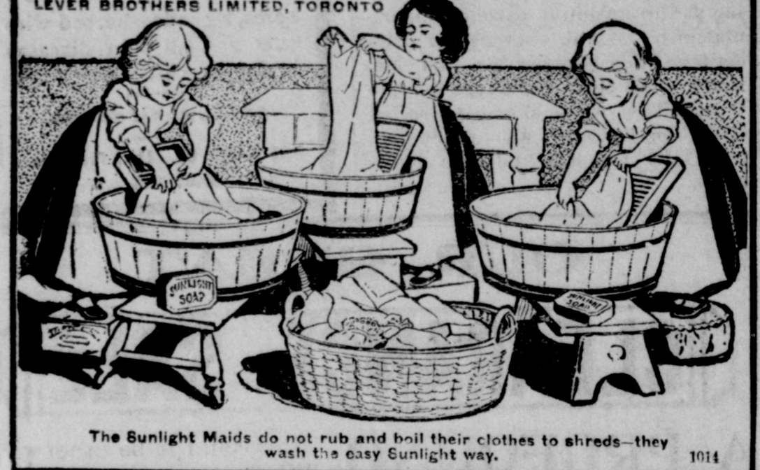
The Sunlight Maids do not rub and boil their clothes to shreds—they wash the easy Sunlight way.

5c. FIVE CENTS 5c. LEVER BROTHERS LIMITED, TORONTO