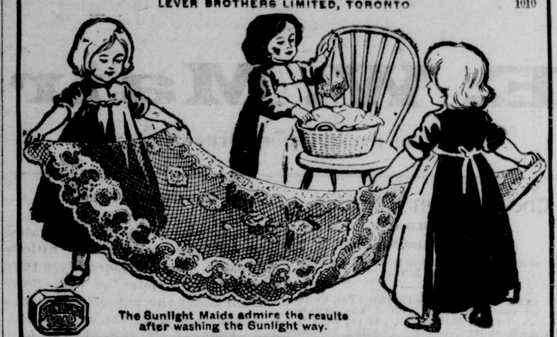
The Sunlight Maids admire the results after washing the Sunlight way.

5c. FIVE CENTS 5c. LEVER BROTHERS LIMITED, TORONTO 1010