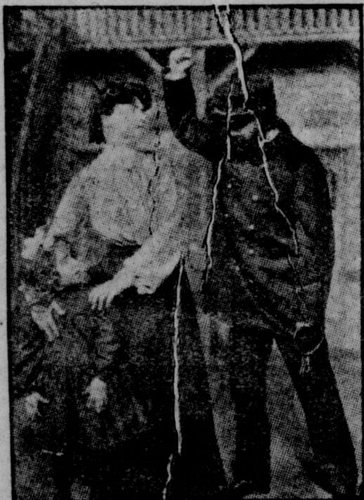
"When Women Love."