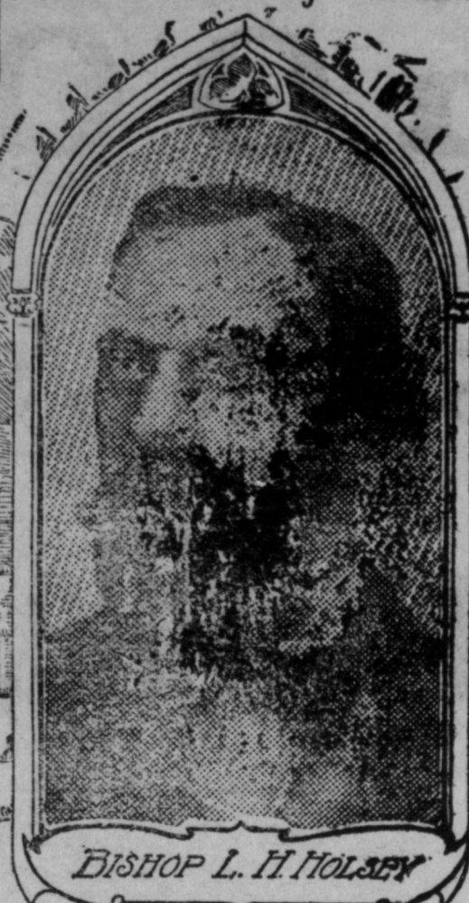
The Bishop's Strong Tribute to Pe-ru-na.

He Declares Pe-ru-na to Be a Triumph of Medical Science, A Magnificent and Sovereign Remedy. Having Tried Many Remedies and Failed to Find a Cure, Tried Pe-ru-na and Was Promptly Relieved.