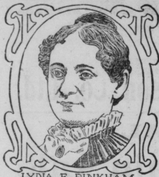
LYDIA E. PINKHAM

No other medicine has been so successful in relieving the suffering of women or received so many genuine testimonials as has Lydia E. Pinkham's Vegetable Compound.