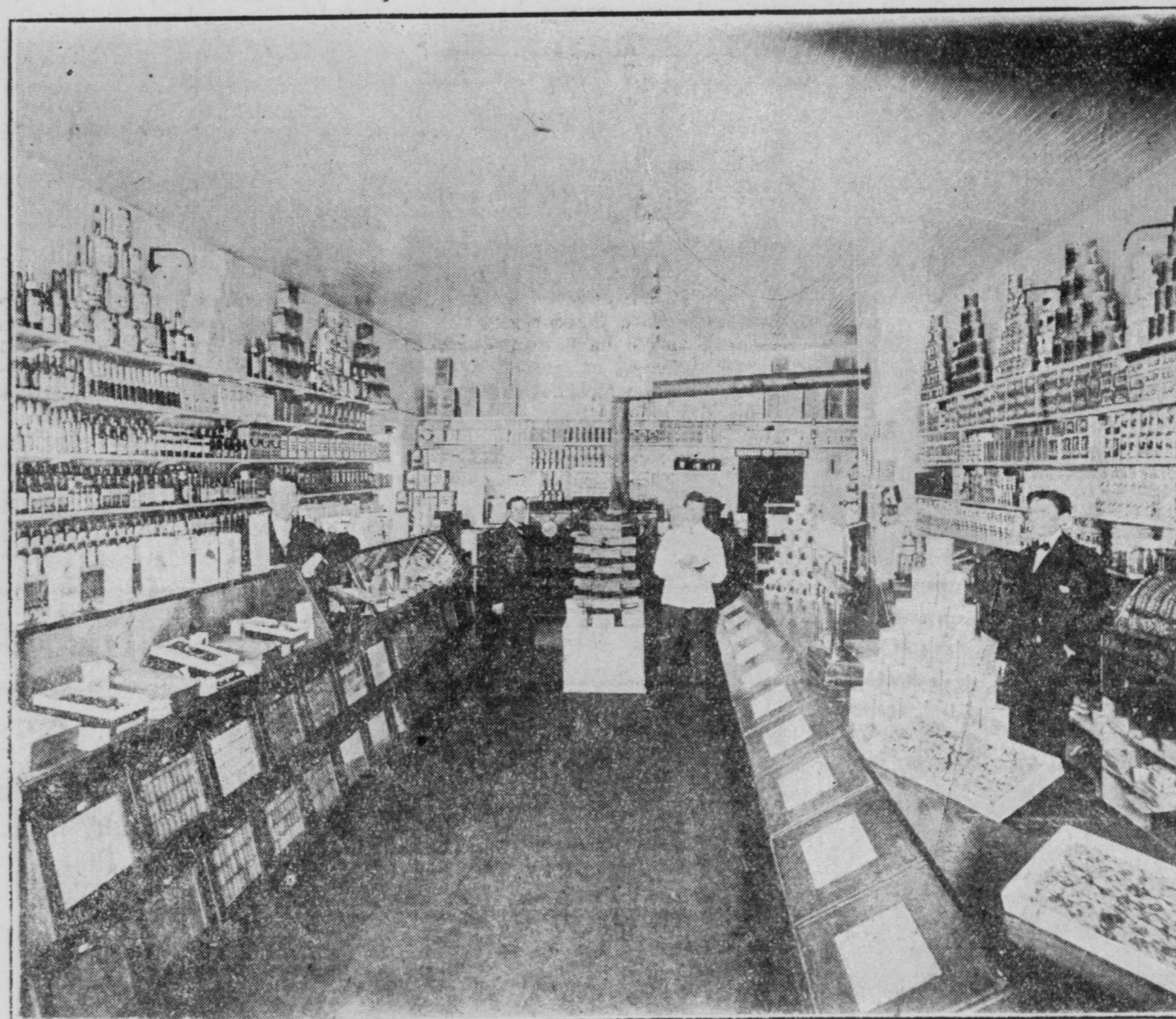
INTERIOR VIEW OF OUR STORE, SHOWING DUST PROOF CASES

Also Bear in Mind that when you buy delicate articles from us, such as Dates, Figs, Table Raisins, Fancy Biscuits, etc.,