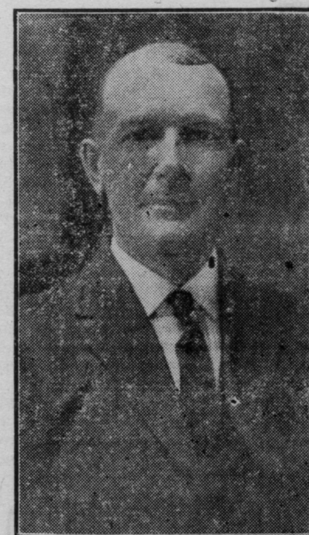
FRANK R. SHAW

The Flemming Government Has Increased the Public Debt $1,057,960.17