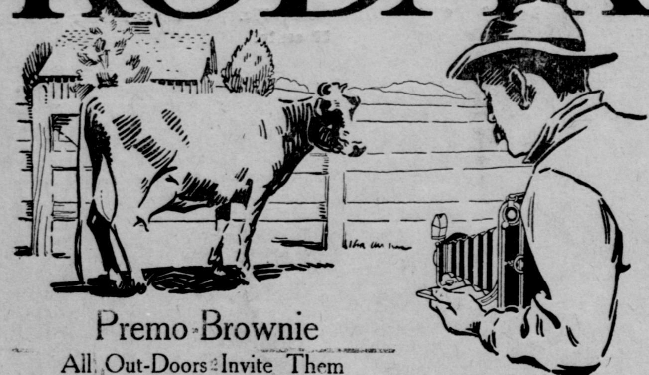
Premo-Brownie All Out-Doors Invite Them

The unobtrusive Companion that keeps the Picture Story of your Vacation.