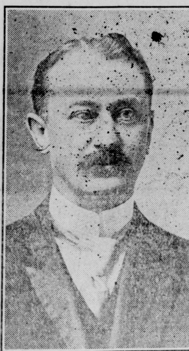
HON. CLIFFORD ROBINSON.