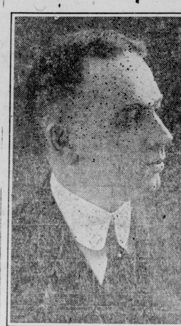
PREMIER W. E. FOSTER.