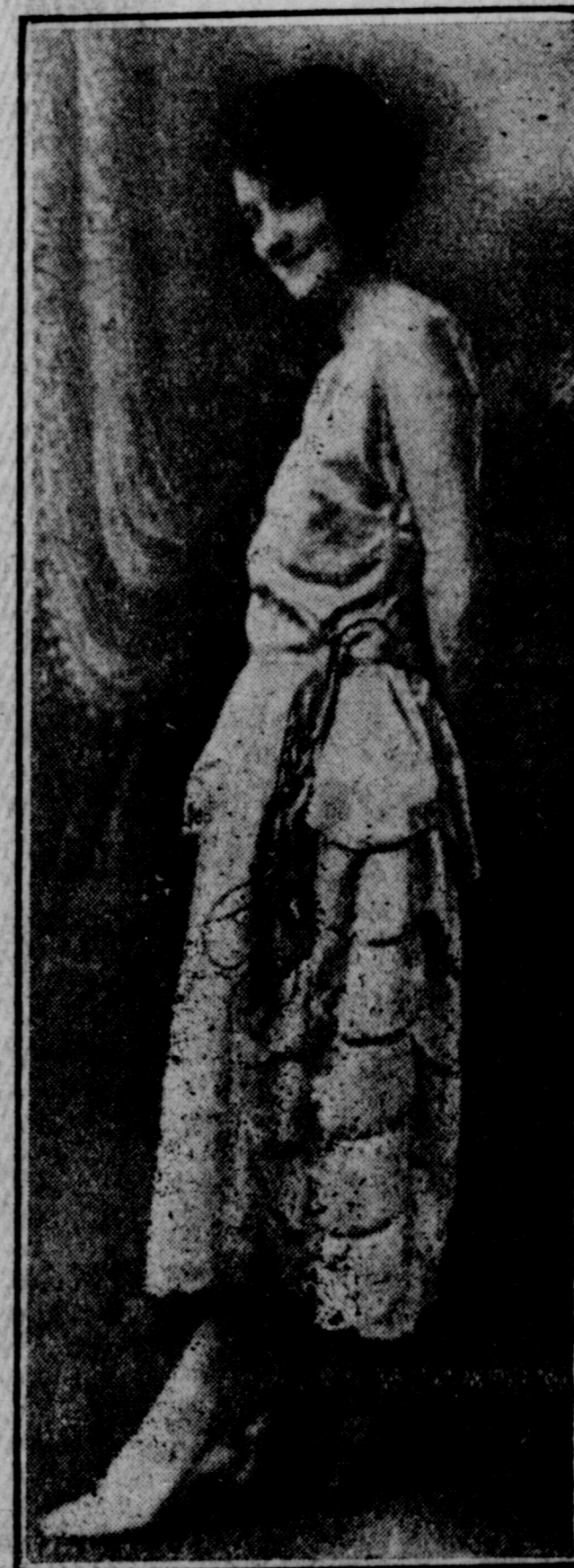
Miss Canada, (Woodstock Sketch)

grants that there will be a gain among the class who were good husbands when sober, but who became 44 calibre fiends when intoxicated, and then asks, "but what of the opposite fellow in whom the milk of human kindness never flowed until it was primed, as the motorist would say, with intoxicating beverage?" In order to determine whether you are one of the new grouches, the paper asks these questions: "Are you sour when sober? Have you become fast, insisting that your children go to bed at 8 o'clock? Do you think everything has gone to the dogs? Do you snarl at the persons you once described as the best folks in the world? Have you thought of resigning from the lodge? If so, sign on the dotted line." The Citizen is still hopeful, however, and looks forward to the day when, from the pressure of necessity, a new Pollyannaesthetic may be discovered.