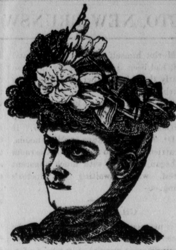
For Style, Quality and Price our Millinery is unexcelled.

Also-Headquarters for all kinds of Ladies', Misses' and Children's Corsets and Corset Waists. We are sole agents for the popular S. C. Corsets, Madame Warren's Dress Form Corsets, and Madame Dean's Spinal Supporting Corsets.