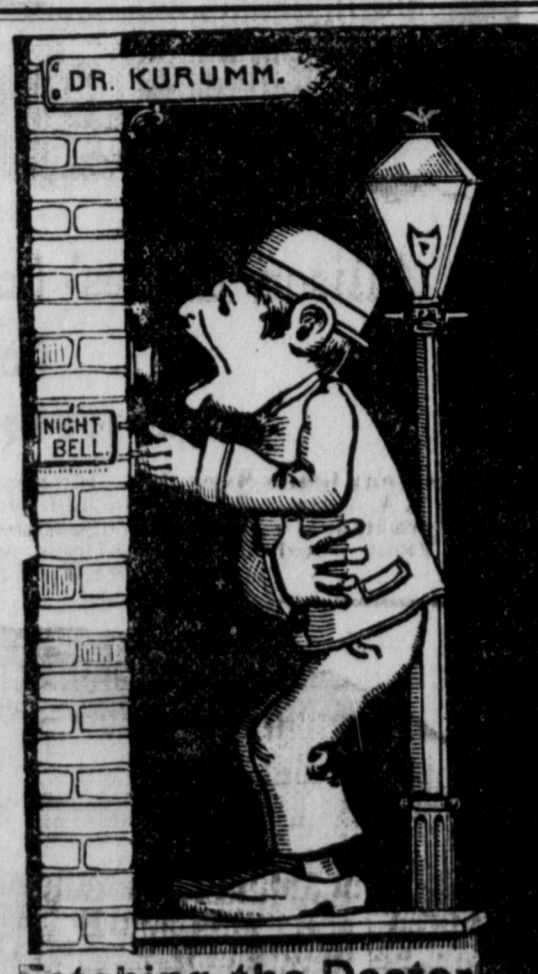
Fetching the Doctor

There are other ministers of love more conspicuous than a good daughter, but none in which a gentler, lovelier spirit dwells, and none to which the heart's warm requitals more joyfully responds. She is the steady light of her father's house. Her ideal is indissolubly connected with that of his happy fireside. She is the morning sun and evening star. The grace, vivacity, tenderness of her sex have their place in the mighty sway which she holds over her spirit. The lessons of recorded wisdom which he reads with her eyes comes to his mind with a new charm, as blended with the beloved melody of her voice. He scarcely knows weariness which her song does not make him forget, or gloom which is proof against the young brightness of her smile. She is the pride and ornament of his hospitality and the gentle nurse of his sickness, and the constant, numberless acts of kindness which one chiefly cares to have rendered because they are unpretending but expressive proofs of love.