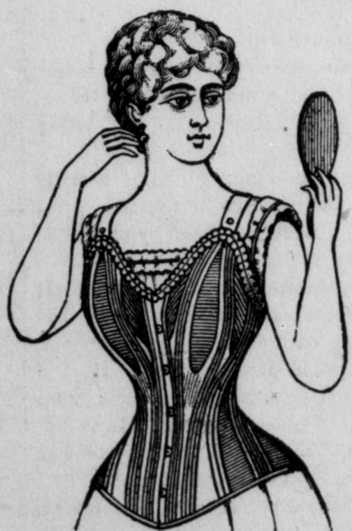
The Genuine Madame Warren's Dress Form Corsets.

While the Corset is of the greatest benefit to ladies of a slim figure, enabling them to fit and wear their dresses to the best advantage, it is by no means intended for those alone, it will support the bust of ladies of a stout figure and will improve the shape of the wearer and the fit of the dress in every instance, no matter how perfect the natural figure. A pair of the above Corsets sent by mail to any address on receipt of price $1.57. Headquarters for all kinds of Ladies', Misses' and Children's Corsets and Corset Waists.