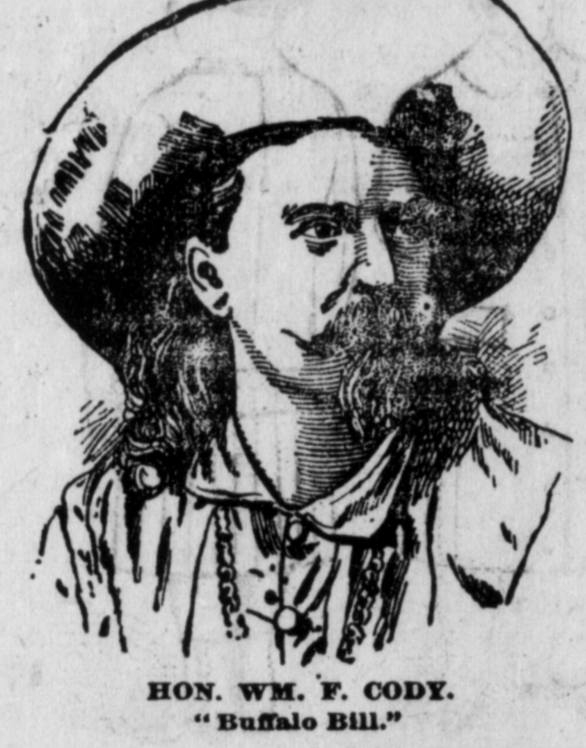
HON. WM. F. CODY, "Buffalo Bill."

Many are familiar with the famous "Buffalo Bill," wonderful wild west show. Prior to his venture abroad, Mr. Cody exhibited at Staten Island, in New York Harbor, where he became afflicted with malaria. Knowing the virtues of Kickapoo Indian Sagwa, Mr. Cody sent to the agents for this wonderful Indian remedy, and after using a few bottles was permanently cured. "Kickapoo Indian Sagwa is a remarkable medicine," said Mr. Cody, "and I have known of its virtues a long time. You may use my name, and say that for what it claims to do it has no equal, and for malaria and chills it is far superior to quinine in many ways." Kickapoo Indian Sagwa is also a sure cure for Rheumatism, and if the Kickapoo Oil is used at the same time it is impossible for rheumatic pains and stiffness to remain. It is the only remedy the Indians ever use, and has been known by them for ages. An Indian would as soon be without his horse, gun, or blanket as to be without Sagwa. This, from the leading plainman in American history, a man whose integrity is unquestioned, should prove beyond a shadow of doubt that Kickapoo Indian Sagwa is just what is claimed for it: an honest medicine of superior curative qualities, combining the best of the vegetable kingdom gathered from the forests and gardens of nature.