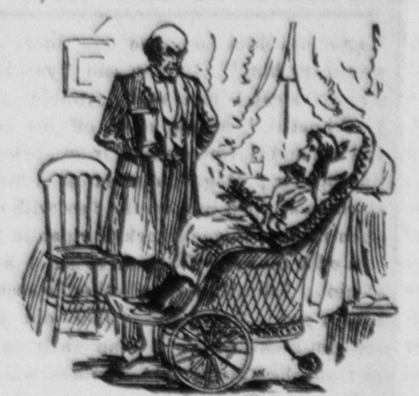
"Was merely a shadow of her former self."

It is now a common thing in this locality to hear people acknowledge the wonderful benefit they have derived from the use of Dr. Williams' Pink Pills, and it is not to be wondered at that the druggists find the sale of this remarkable medicine so large and yet constantly increasing.