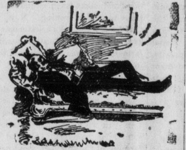
"WAS UNABLE TO WALK AROUND."

From the Simcoe Reformer. The many virtues of Dr. William's Pink Pills for Pale People have so often been published in the columns of this paper, that they are widely known to the residents of Norfolk County, and it is as widely conceded that they have brought joy into more than one household, and their merits are spoken of only in words of praise.