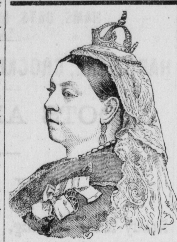
Our Beloved Queen.

She Passes Away at 6.45 p. m. at Osborne House.