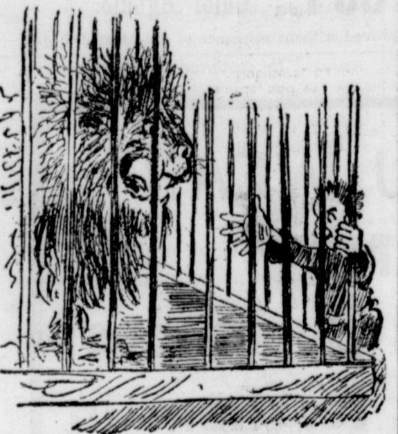
DON'T TEASE HIM

our stock when wanting anything in our line. You will find us "straight up and down" about the quality and merits of our stock. We offer goods without misrepresentation and, having named the lowest prices to the customer, we