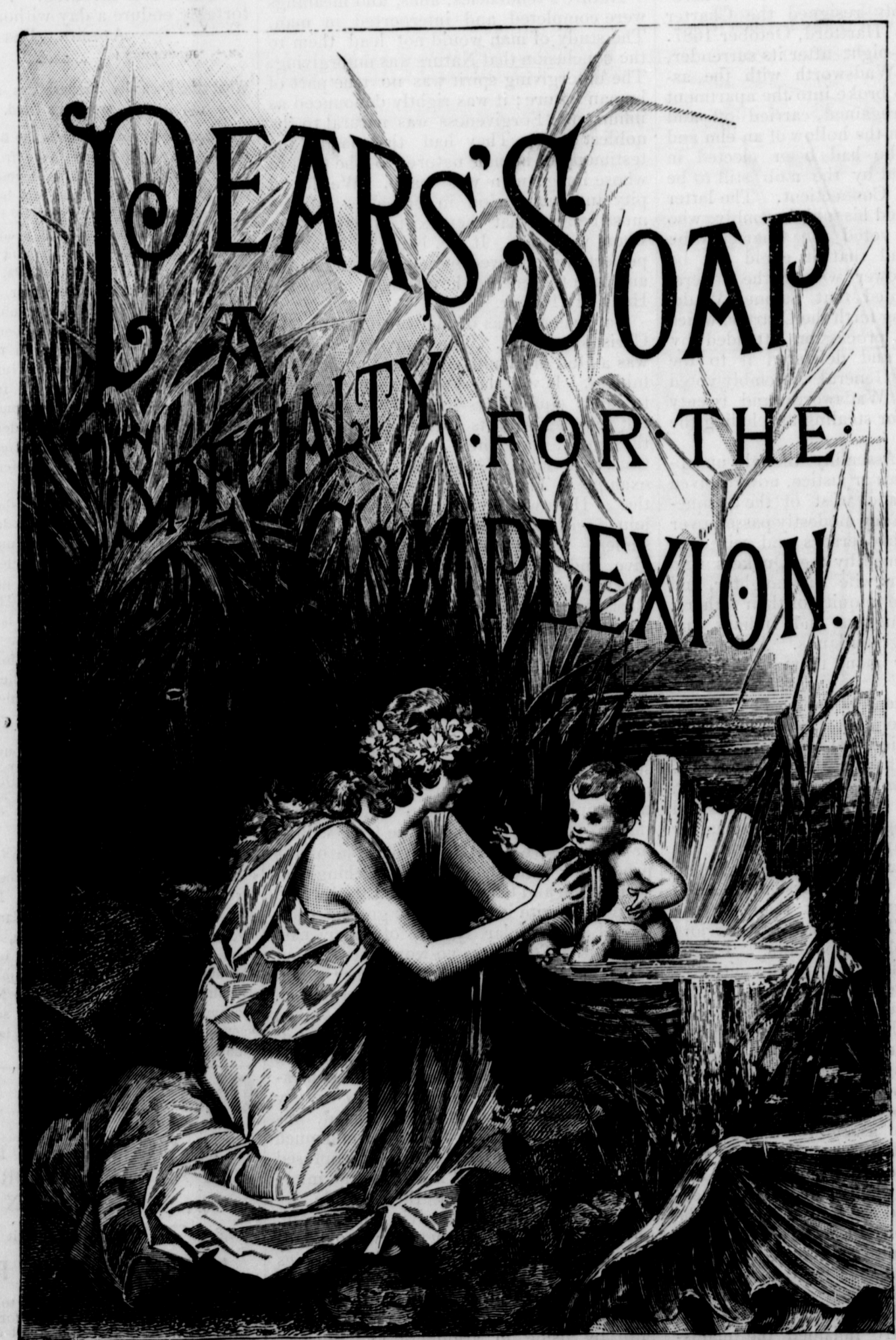
A SPECIALTY FOR INFANTS.