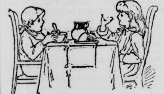
TABLE TALK: THE FASHION OF THE DAY—FRENCH AND GERMAN GOODS.

While the Scotch Plaids with their predominating blue and green combinations figure very extensively among the imported plaids. We are also displaying a rich collection of French and German Plaids, in some of the most beautiful blendings. Plaids undoubtedly rank among the most fashionable of this season's dress fabrics, and from the variety we display it will very quickly be seen that we early appreciate their importance. At 20 cents per yard there is a large assortment, a still more interesting one at 65 and 80 cents, while the better qualities sell at 95 cents, $1.10 and $1.40.