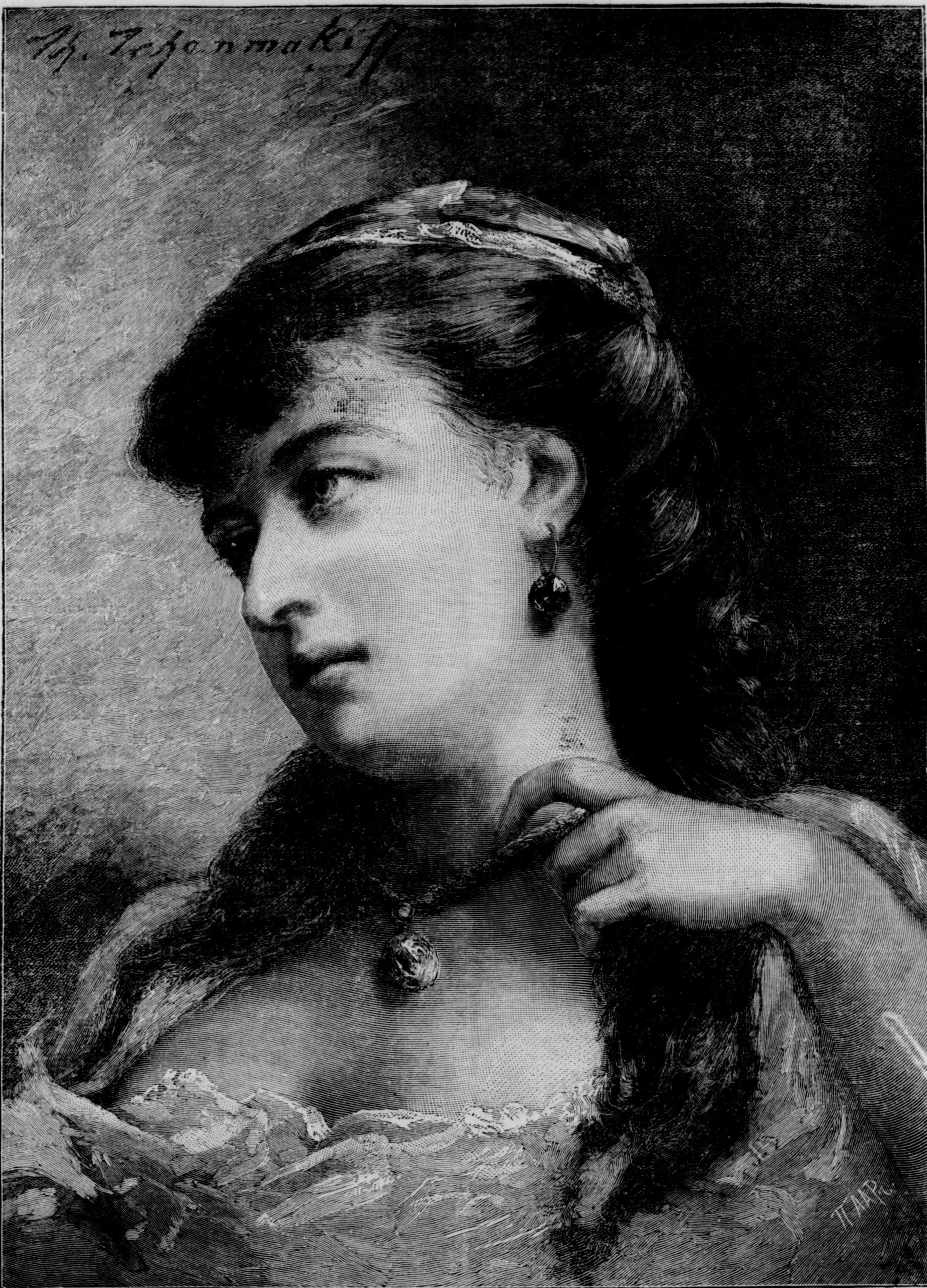
A RUSSIAN BEAUTY.