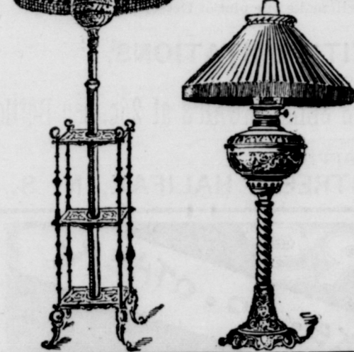
Table and Floor Lamps

C. FLOOD & SONS, ST. JOHN, Keep in stock the largest variety of fine quality