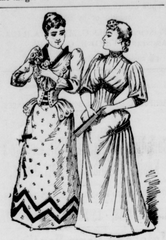
TWO TROUSSEAU GOWNS.

NEWPORT, August 14.—All yesterday afternoon I sat under woodbine leaves and watched a fete that was interesting. I say I sat under the leaves because it is already late summer, and in the still air leaf after leaf detached itself from its ripe stem and slowly floated down upon the piazza steps or upon my shoulder. A locust in the tangle of vines overhead never ceased