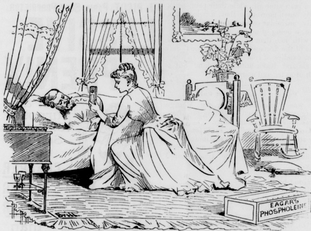
PHOSPHOLEINE HAS RESCUED YOU FROM THE JAWS OF DEATH.

Phosphorus, which is one of the principal constituents of EAGAR'S PHOSPHOLEINE is the only remedy which has given satisfactory results in the case of Defective Nerve Power, Mental and Muscular Debility, induced by overwork, worry, early indiscretion, etc.; it is also recommended in all diseases attended with diminution of the vital force, Softening of the Brain, Melancholy, Facial Neuralgia, Sciatica, and all cases involving both the cerebral and spinal centres. It will also prove of value in restoring the strength in the convalescence following fevers, Diphtheria and other serious illness.