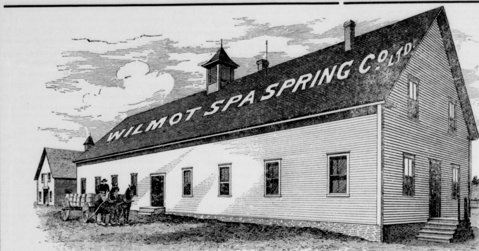
FAC-SIMILE, FROM PHOTOGRAPH OF WILMOT SPA SPRINGS FACTORY.

HAROLD GILBERT'S WAREHOUSES, - 54 KING STREET.