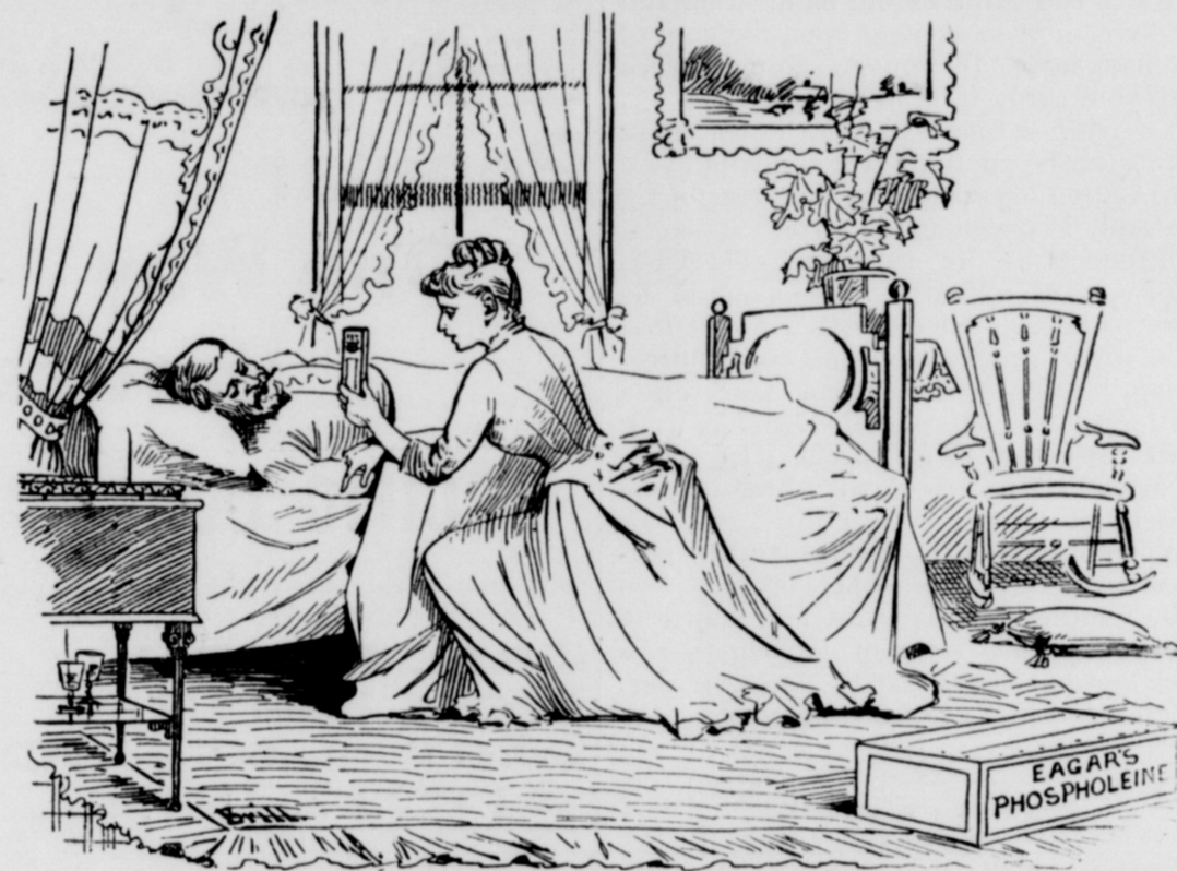
PHOSPHOLEINE HAS RESCUED YOU FROM THE JAWS OF DEATH.

This is often the result of nervous debility, and in such cases half the smallest dose, gradually increased to the smallest dose and persisted in for some time, will if the cause be not kept up, effect a cure.