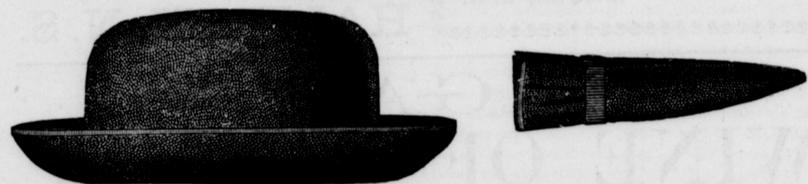
These cuts illustrate our NEW SEAMLESS WATERPROOF HATS, weighing only 4 ounces; made in 4 colors—Black, Blue, Brown, Light Sage,—comfortable, stylish, durable. TRY THEM. Wholesale and Retail.

ESTEE & CO. (Standard Rubber Goods) Sole Selling Agents, 68 Prince Wm. Street, St. John, N. B.