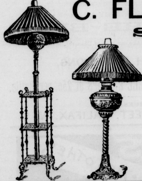
Table and Floor Lamps