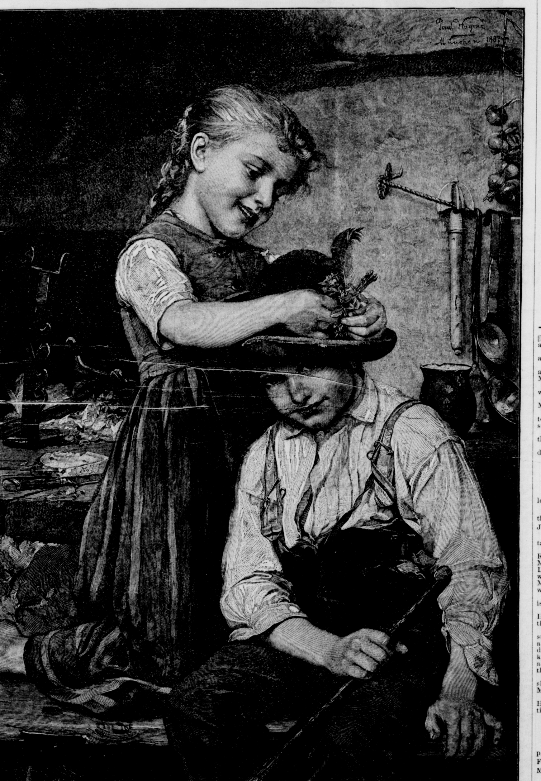
THE FAVORED KNIGHT.