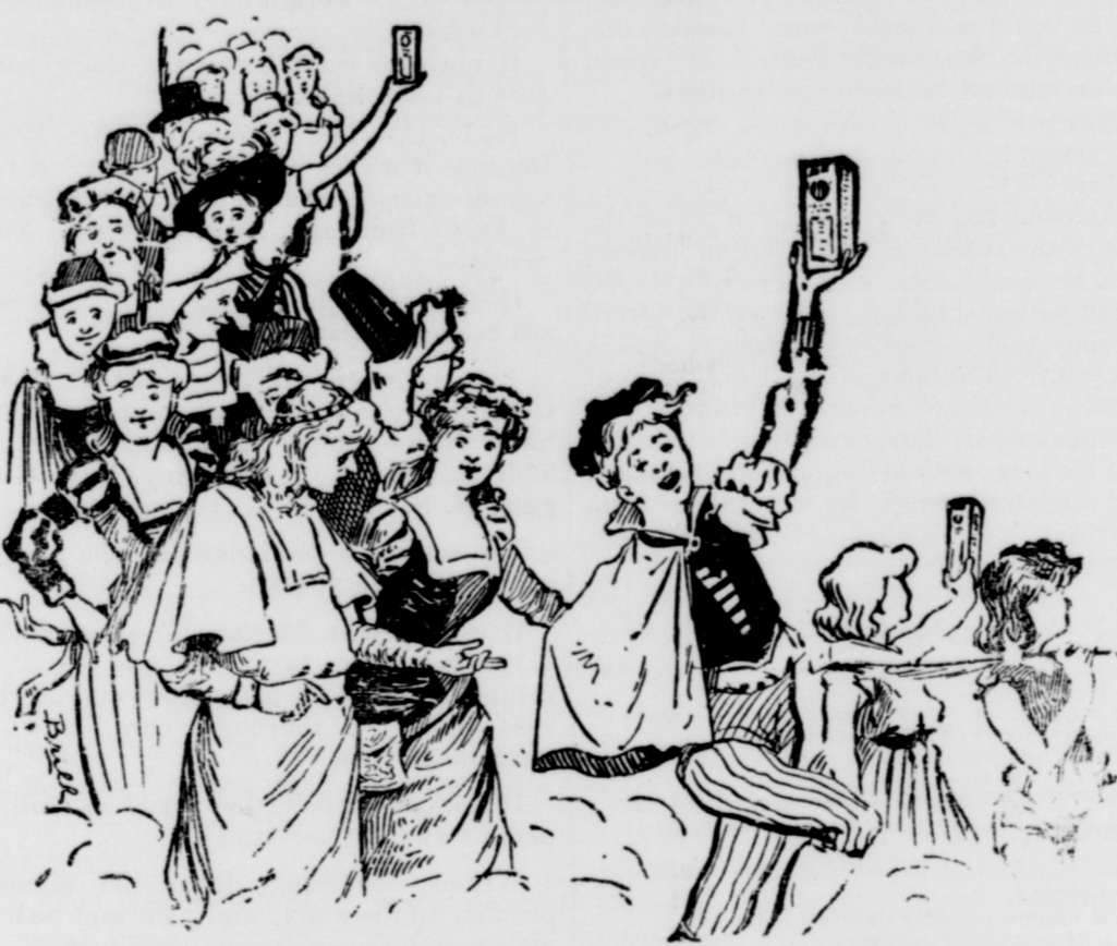
PARTIES WHO HAVE BEEN CURED, GOING ON THEIR WAY REJOICING.