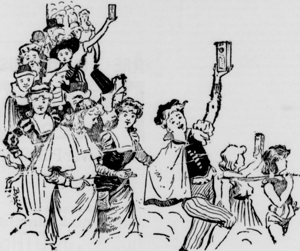
PARTIES WHO HAVE BEEN CURED, GOING ON THEIR WAY REJOICING.