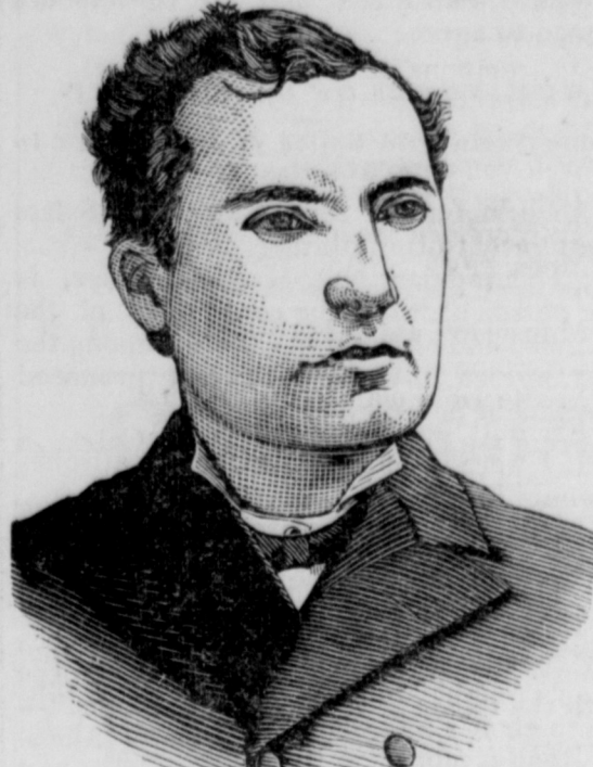
SURVEYOR GENERAL TWEEDIE.