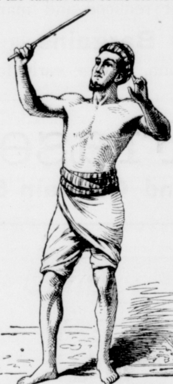
AN EAST INDIAN JUGGLER.

These having been provided, the chief juggler made a small, tent-like structure with the canvas and some stools. He then