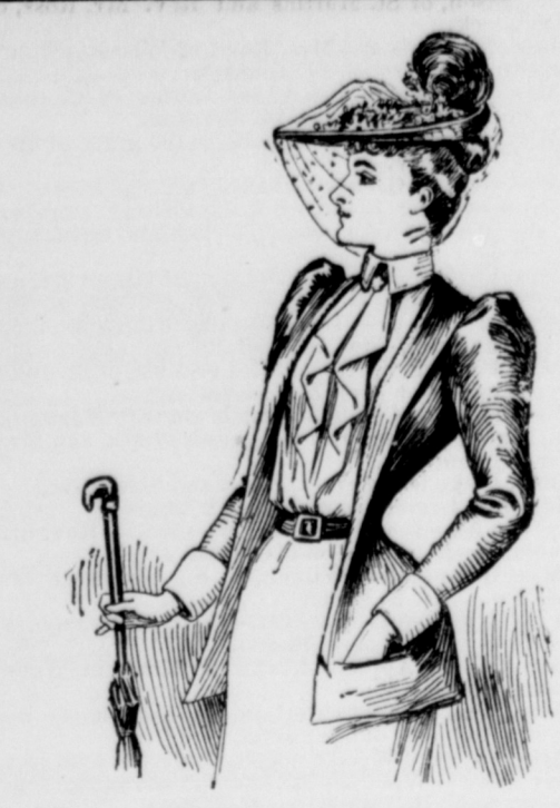
SAMPLES MAILED TO ANY ADDRESS.

very much in price to effect a speedy clearance.