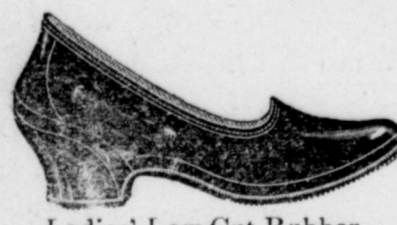
Ladies' Low Cut Rubber.