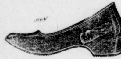
Ladies' Light Rubber.