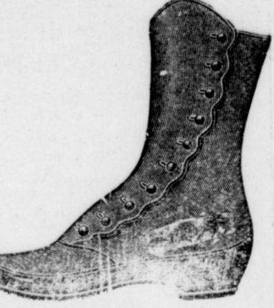
Ladies' Button Overshoe.