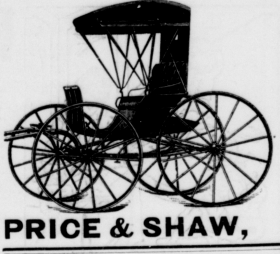
PRICE & SHAW, Main Street.

BANGOR BUGGIES (with top). BANGOR WAGGONS (without top). are Fashionable, Comfortable and Stylish. WE HAVE THEM.