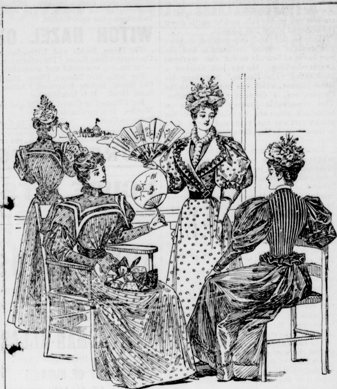
NOVELTIES IN SUMMER ATTIRE.

trim, sensible, tailor-made skirt which was all it pretended to be and had nothing to conceal, was ever deposed. However, I suppose it is useless to lament over a departing fashion however pretty it may have been; no doubt we should have grown