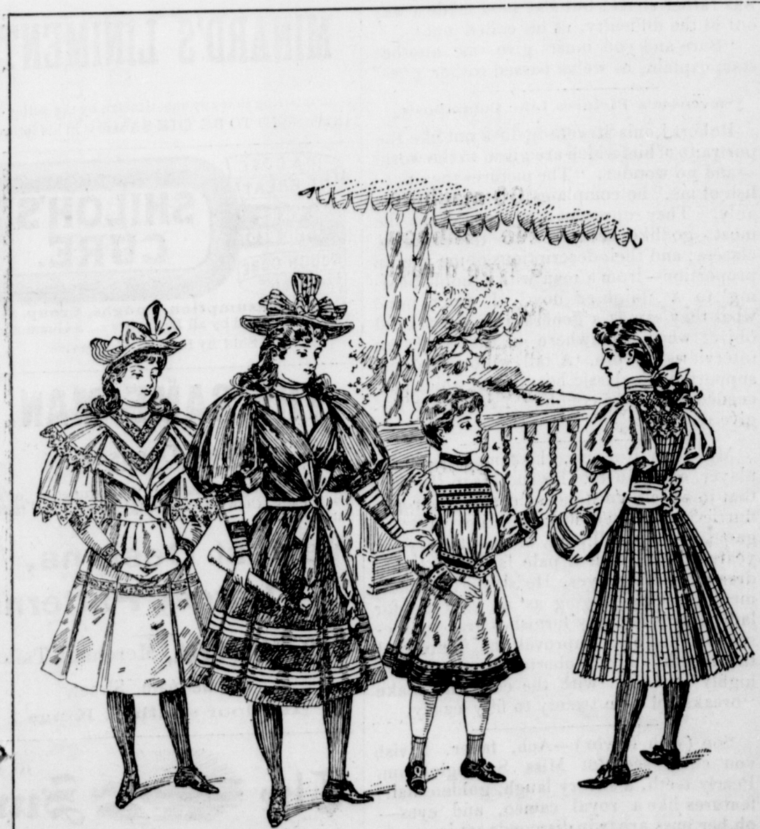
COSTUMES FOR CHILDREN.

"PROGRESS" ENGRAVING BUREAU, ST. JOHN, N. B.