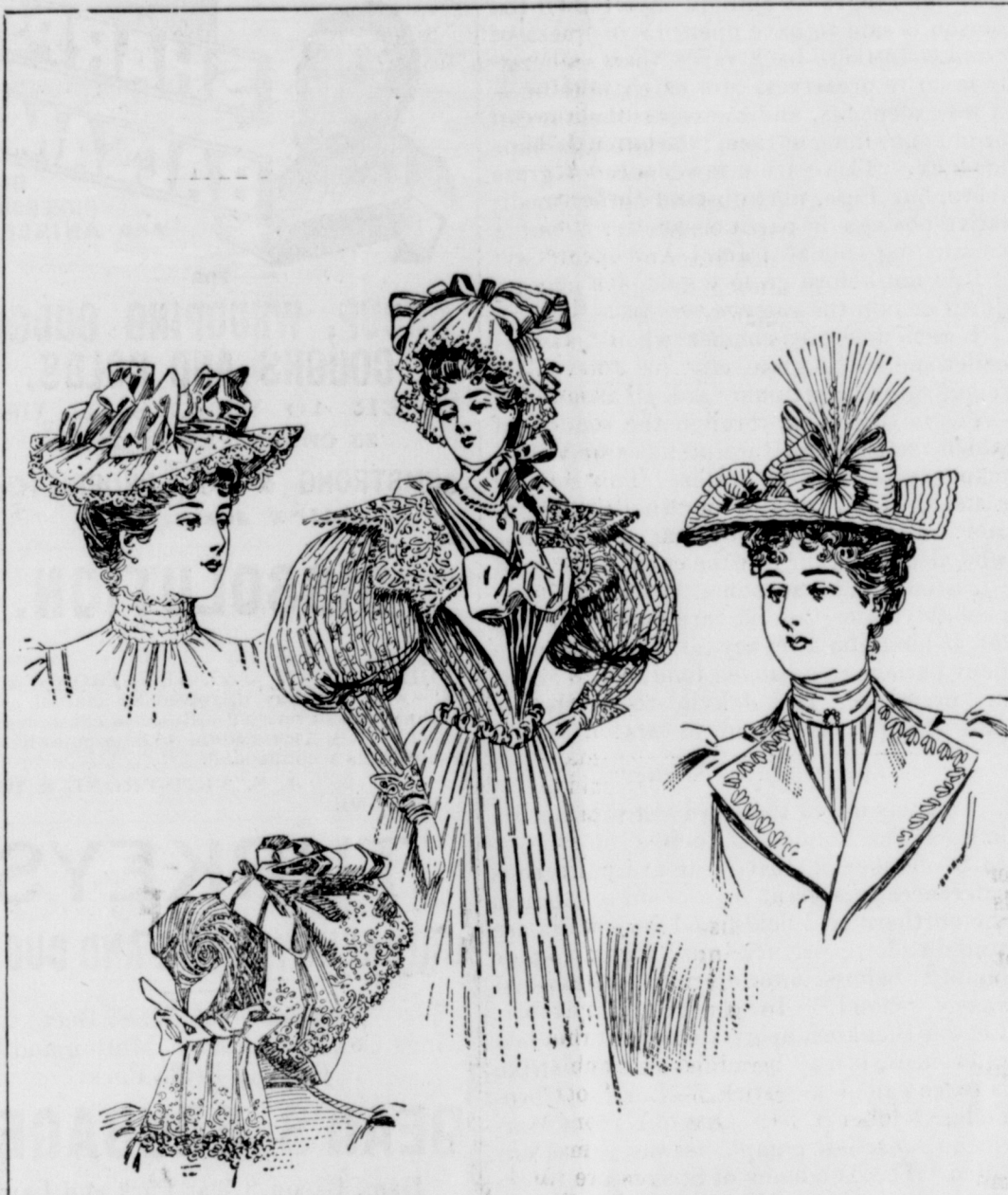
THE LATEST IN HATS.

The pretty and durable mohair and alpaca which have been out of style so long, are once more in favor, and made up in stylish costumes for visiting, plain dresses, for travelling, boating and outing generally. One charming dress was made of fine lustrous gay alpaca, and was made with a cotton yoke coat, quite short and opening over a vest of pale blue chiffon. The revers of the coat were faced with white moire silk and extended into a turned over collar; the sleeves were full leg of mutton and trimmed with milliner's folds of the alpaca; the entire coat was lined with white satin, and the plain gored skirt was trimmed