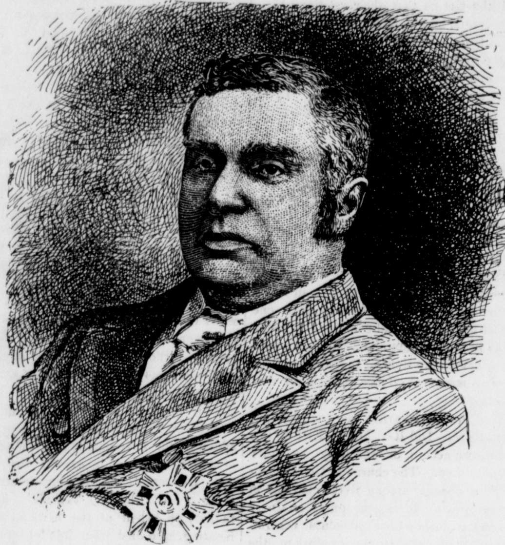
SIR JOHN S. D. THOMPSON.

AMATEUR PHOTOGRAPHERS. Printing and general finishing for amateurs. Develops, Toning and fixing solutions for sale. LUCIEN PHOTO STUDIO, 38 Charlotte St., St. John, N. B. 11-9 tt.