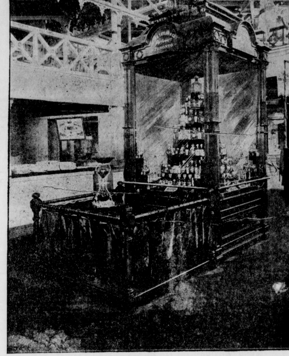
JOHN TAYLOR & CO'S PERFUMERY EXHIBIT, TORONTO INDUSTRIAL EXHIBITION, 1895.