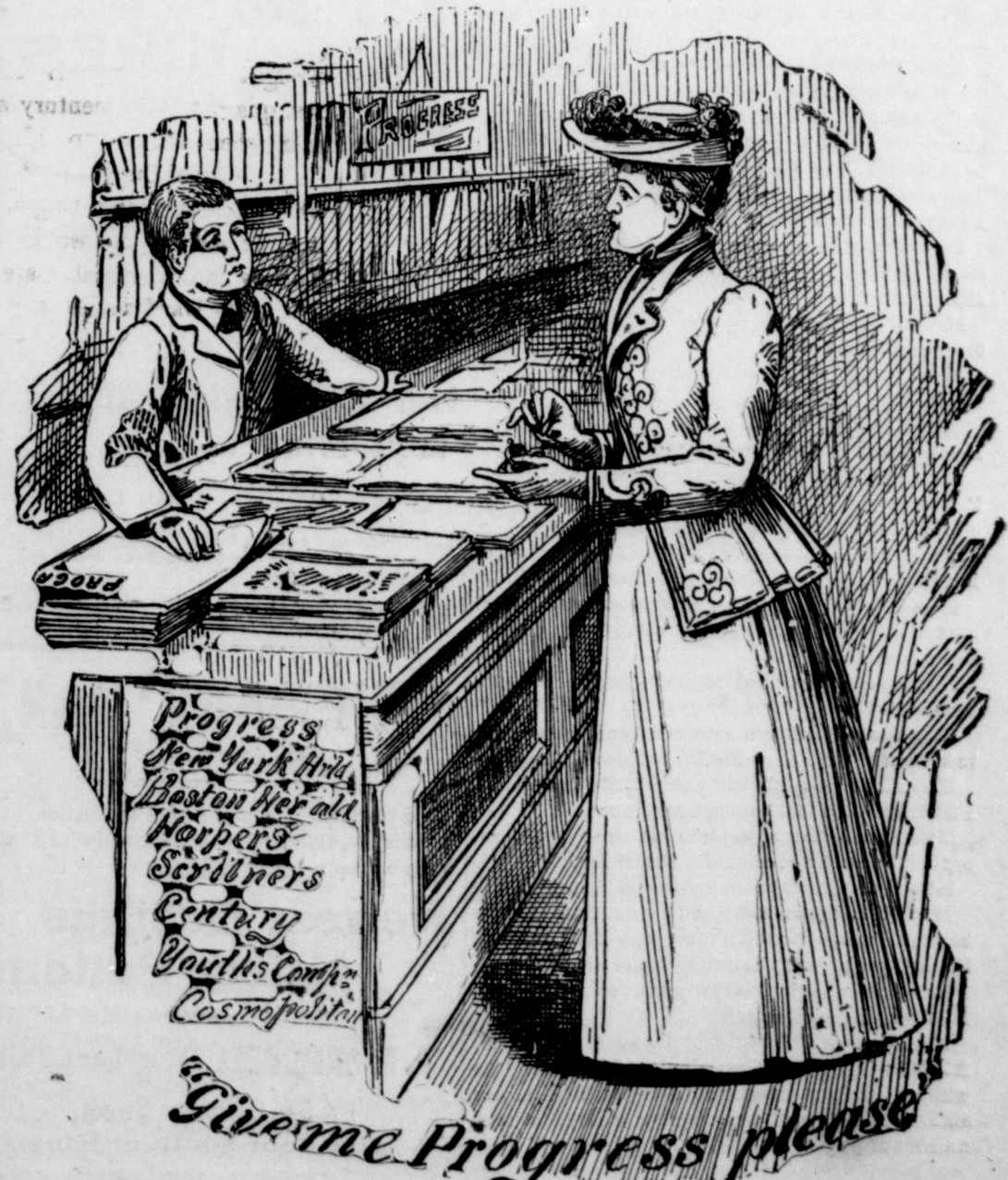
Give me Progress please

For further Particulars and Prices inquire of JOHN EDGECOMBE & SONS, Fredericton, N. B.