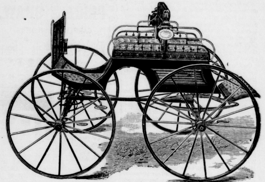
A Stylish Dog Cart. Will carry Two or Four with comfort.

CARRIAGES! CARRIAGES! Handsome and Comfortable; Well Constructed and Elegantly Finished. HERE ARE TWO DISTINCT STYLES.