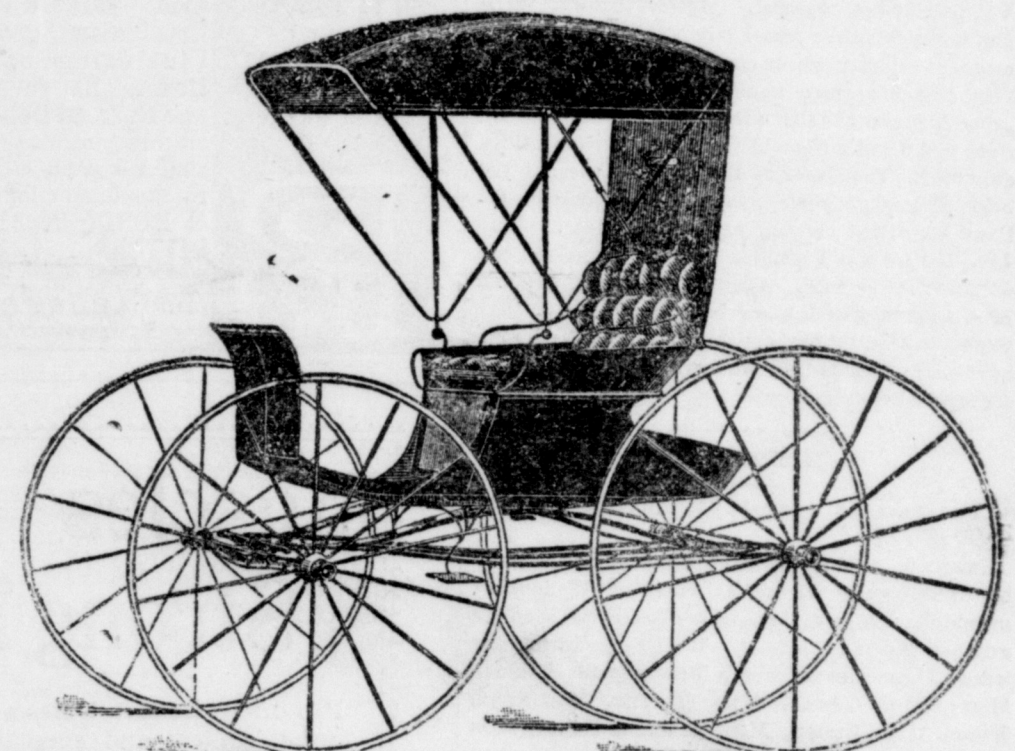
The Comfortable Bangor Buggy. Perhaps one of the most serviceable and comfortable single Carriages built. Rides as easy as a cradle. Not too heavy and as light as you want it made.

For further Particulars and Prices inquire of JOHN EDGECOMBE & SONS, Fredericton, N. B.