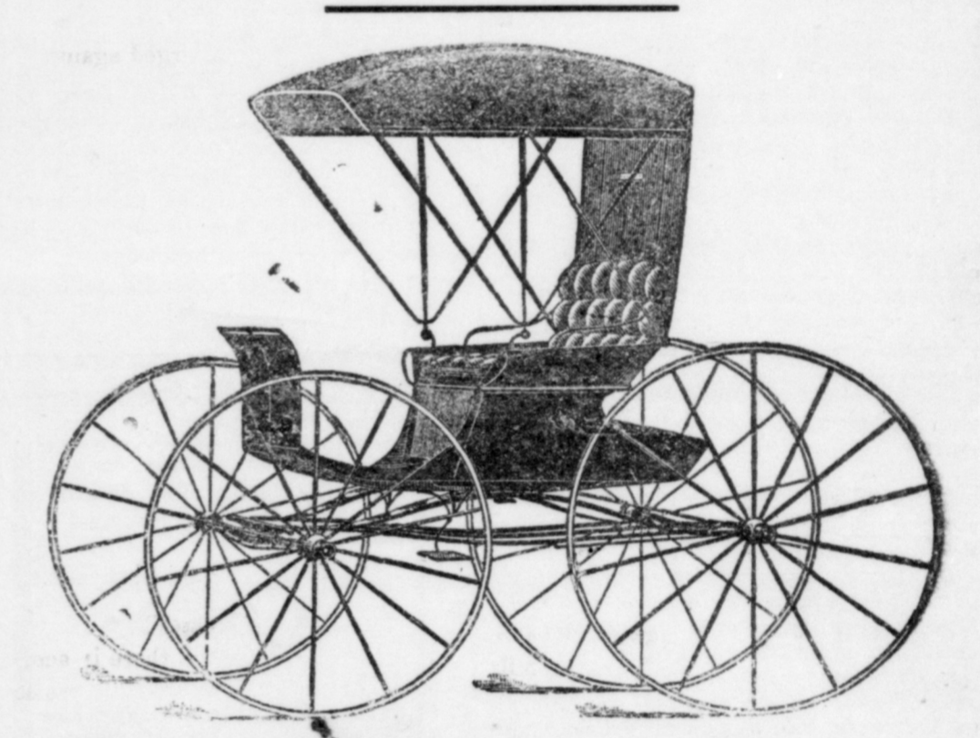
The Comfortable Bangor Buggy. Perhaps one of the most serviceable and comfortable single Carriages built, Rides as easy as a cradle. Not too heavy and as light as you want it made.

For further Particulars and Prices inquire of JOHN EDGECOMBE & SONS, Fredericton, N. B.