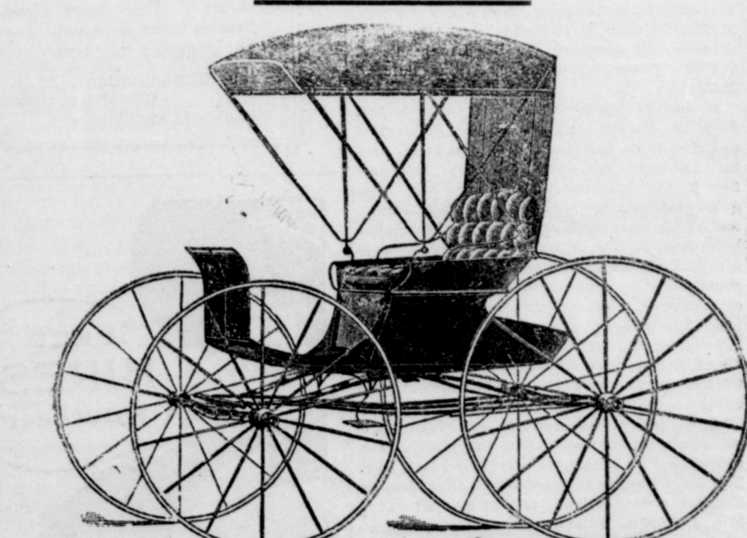
The Comfortable Bangor Buggy. Perhaps one of the most serviceable and comfortable single Carriages built, Rides as easy as a cradle. Not too heavy and as light as you want it made.

For further Particulars and Prices inquire of JOHN EDGECOMBE & SONS, Fredericton, N. B.